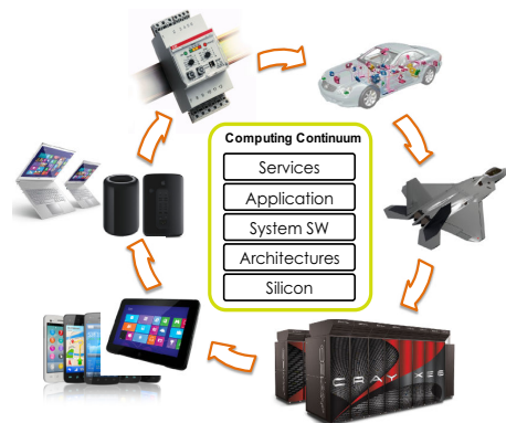
Figure 1: The computing continuum

susceptibility to transient faults (soft errors) and permanent faults (device degradation, wear-out) [2]. One of the biggest challenges for future technologies is the implementation of “dependable” systems on top of significantly unreliable components, which will degrade and even fail during normal lifetime of the chip.